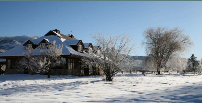
Rock Bottom Ranch 2001 Hooks Spur Road, Basalt, CO 81621 970.927.6760 Wednesday - Friday, 9am - 4pm