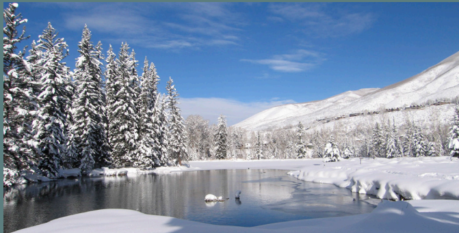
Hallam Lake Nature Preserve 100 Puppy Smith Street, Aspen, CO 81611 970.925.5756 Monday - Friday, 9am - 5pm

Aspen Center for Environmental Studies (ACES), a non-profit environmental education organization, provides programs for all ages in the areas of ecological literacy, agriculture, forest health, ecosystem restoration, and civic leadership. We have three sites in the Roaring Fork Valley, where we offer programs and events all winter long.