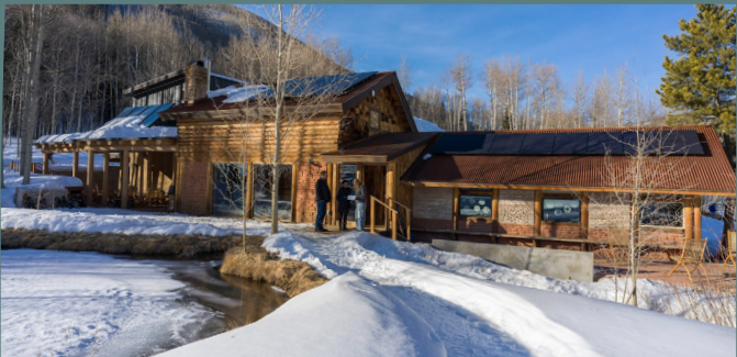
Catto Center at Toklat 11247 Castle Creek Road, Aspen, CO 81611 970.925.9157 Wednesday - Sunday, 12 - 5pm