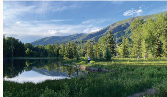
Hallam Lake Nature Preserve 100 Puppy Smith St., Aspen, CO, 81611 970.925.5756 | Monday–Saturday, 9am–5pm

Aspen Center for Environmental Studies (ACES), a non-profit environmental education organization, provides programs for all ages in the areas of ecological literacy, agriculture, forest health, ecosystem restoration, and civic leadership. We have three sites in the Roaring Fork Valley, where we will offer programs and events all year long.