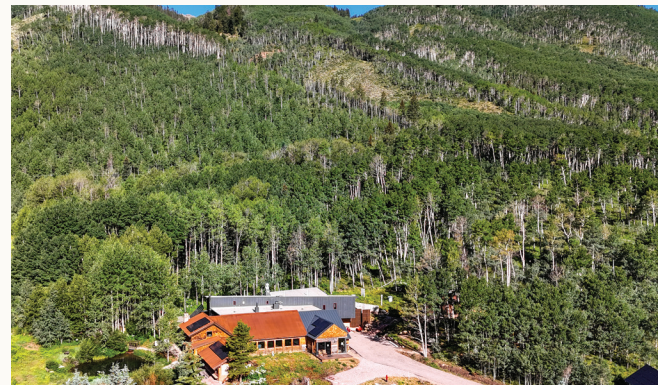
Catto Center at Toklat 11247 Castle Creek Road, Aspen, CO 81611 970.925.9157 | Tuesday–Sunday, 10am–5pm