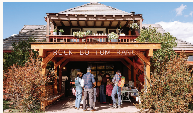
Rock Bottom Ranch 2001 Hooks Spur Road, Basalt, CO 81621 970.927.6760 Wednesday - Friday, 9am–4pm | Saturday, 9am–1pm